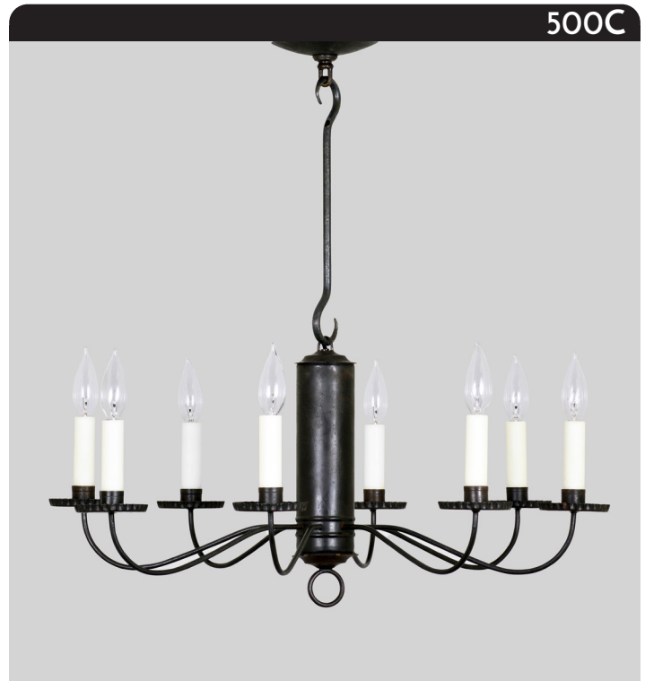
Shown with an aged tin finish.

Originally designed for a ship's cabin, this chandelier's centerpiece was weighted with sand to provide balance and prevent pitching from side to side in rolling seas.