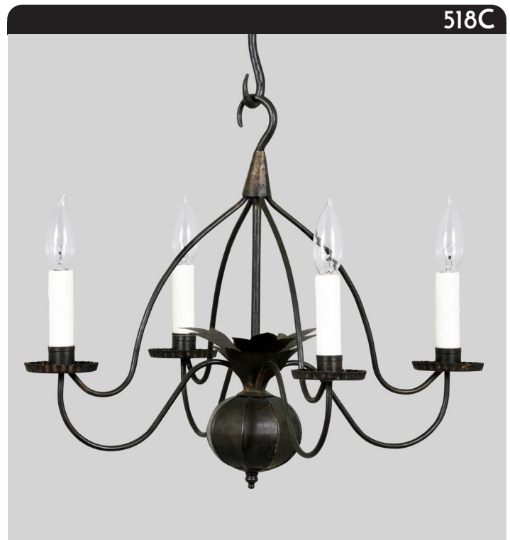
Shown with an aged tin finish.

This French inspired, early 19th century chandelier, has a shape derived from glass bell/cloche used in gardens to protect tender plants.