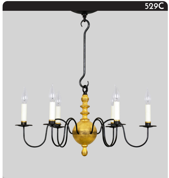
Shown with an aged tin finish & yellow gold leaf.

After many years of war, a metal scarcity forced craftsmen to get creative with materials; thus, the wood column is gilded to look like a metal European Brass Chandelier. Inspired by an early 19th century French chandelier in NY.