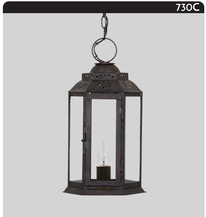
Shown with an aged tin finish.

Inspired by a six-sided European hanging lantern from the late 18th to early 19th century, this fixture is detailed with decorative punchwork, originally intended to vent the candle, highlighting the craftsmanship of the lantern.