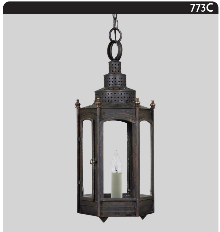
Shown with an aged tin finish.

This style of lantern, with three tiers of decorated punchwork, has long been associated with the demonstrations against the Stamp Act of May 21, 1766, when it allegedly hung from the northwest bough of the Liberty Tree in Boston.