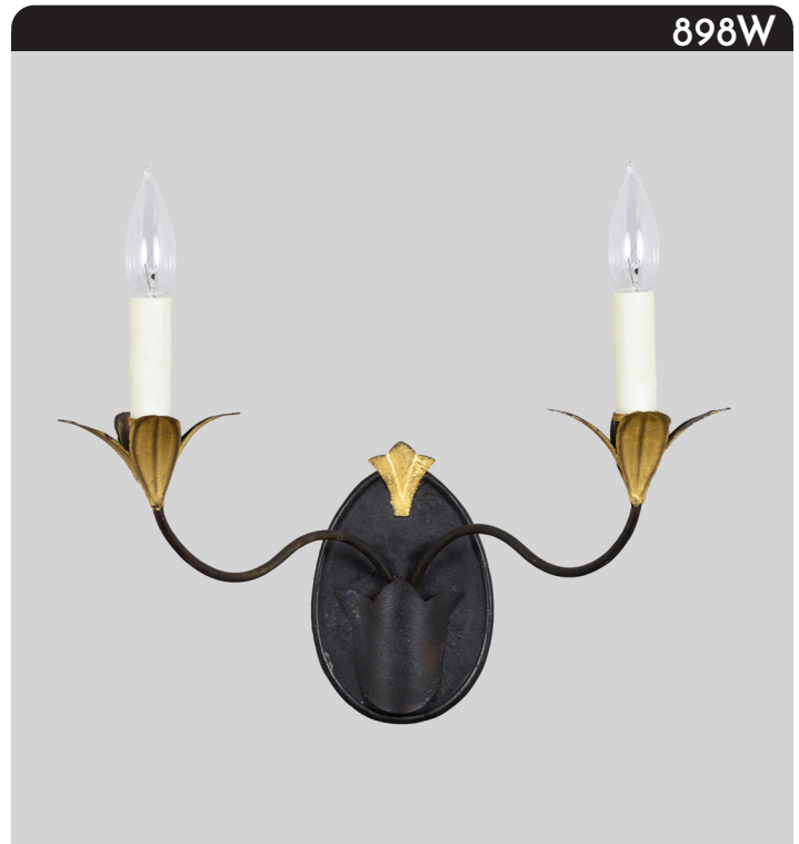
Shown with an aged tin finish & yellow gold leaf.

This 18th century New England inspired double arm sconce is designed to coordinate with the Tulip Chandelier, featuring Gold Leaf and bobeches decorated with tulip leaves.