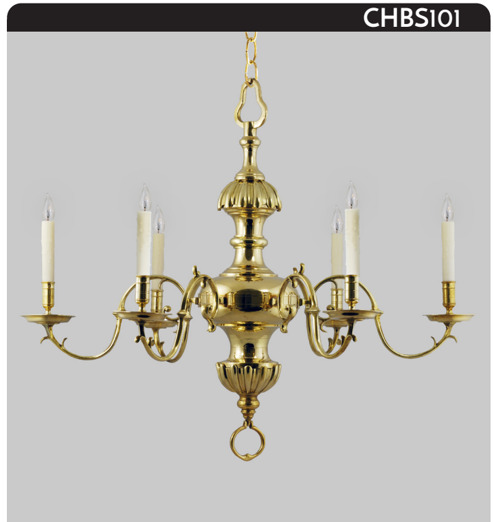
Shown with a polished brass finish.

A timeless English classic, this six-arm chandelier is hand-assembled from parts created using the age-old technique of lost wax casting - capturing the style and old world craftsmanship appropriate to the period.