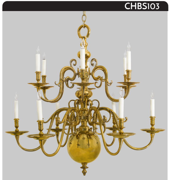
Shown with a polished brass finish.

A timeless Dutch classic, this two tier, twelve-arm chandelier is hand-assembled from parts created using the age-old technique of lost wax casting - capturing the style and old world craftsmanship appropriate to the period.