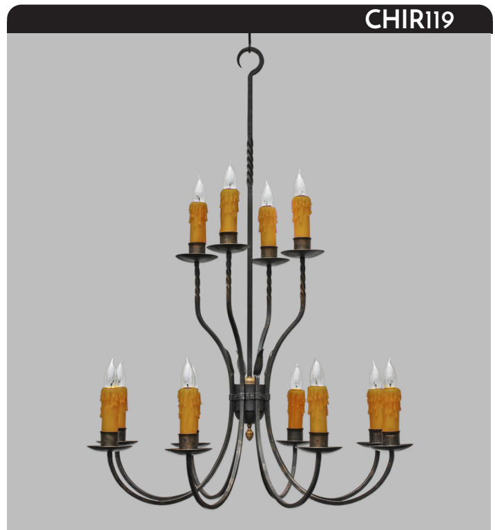
Shown with a natural iron finish.

This twelve-arm forged iron chandelier combines the drama of height with symmetry and organic flow to bring both presence and illumination to large spaces.