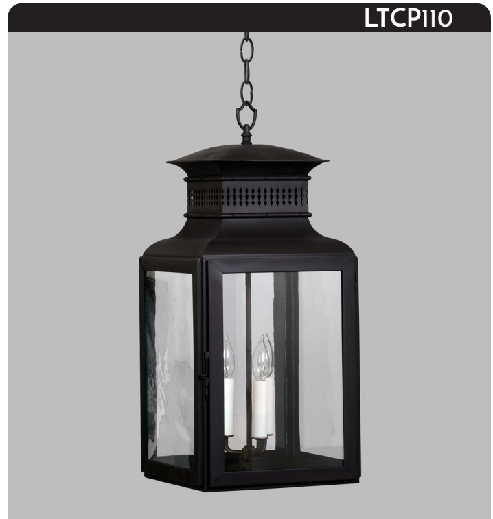
Shown with a black lacquered finish.

This hand formed copper lantern features a cast hanging harp with cast brass arms, encased by antique restoration glass.