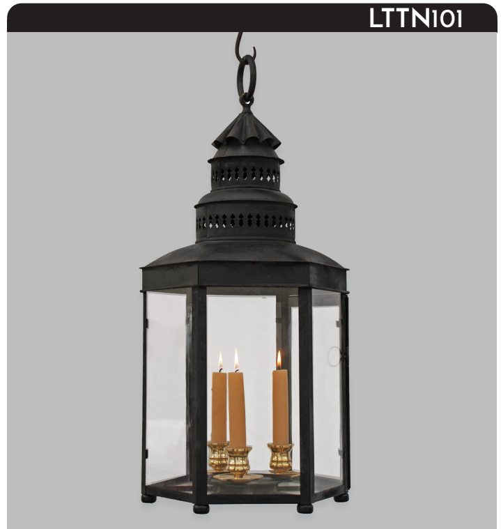
Shown with an aged tin finish.

Originally made from tinned sheet iron, this six-paned lantern is a Winterthur adaption, built with a low domed roof and a pierced, cylindrical chimney. The six compressed ball feet punctuate the corners of the lantern's glass-paneled bottom.