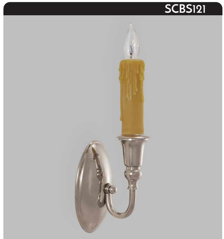
Shown with a polished nickel finish.

To create this handmade brass sconce, a turned candle cup sits atop a formed extruded arm mounted to a cast backplate, indicative of fine workmanship.