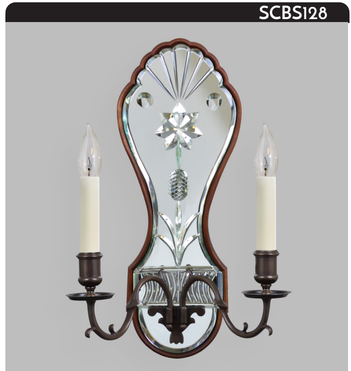
Shown with a bronzed brass finish.

This double arm sconce combines split-seam cast-brass arms mounted with a milled wooden backplate that frames silvered, hand-cut mirrored glass.