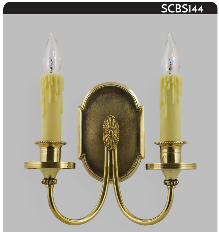
Shown with a polished brass finish.

The details of this handcrafted sconce come from the cast brass backplate and hollow extruded arms. Cast cups and spun bobeches complete the distinct design.