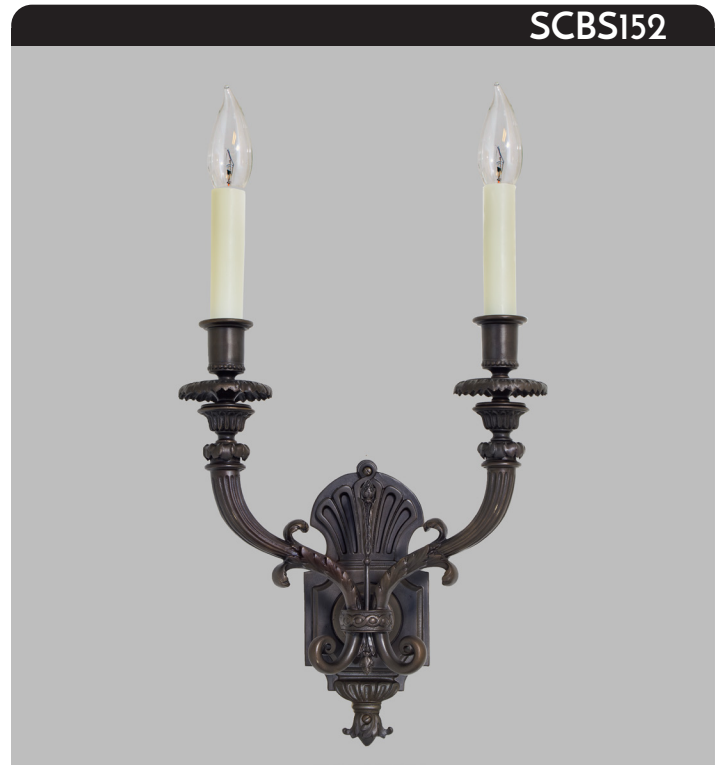
Shown with a bronzed brass finish.

The ornate details of this handcrafted double arm sconce highlight the superiority of the lost-wax casting process in its split-seam arms and the cast details of the seemingly pierced backplate.