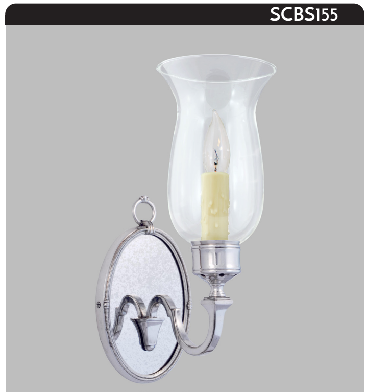
Shown with a polished nickel finish.

This fine quality, handcrafted single arm sconce combines antiqued mirror glass, cast split-seam arms a cast frame and a hurricane shade.