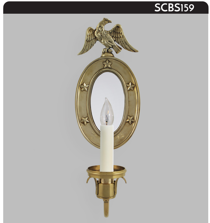
Shown with a polished brass finish.

The fine details in this decorative sconce are evident in the cast brass accents of the eagle, stars and backplate, along with mirrored glass.