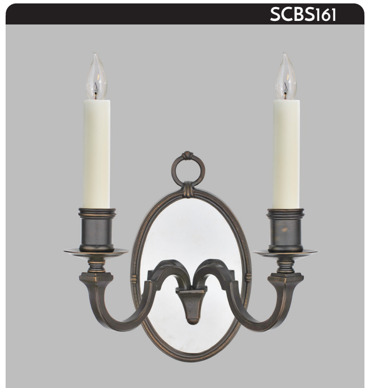
Shown with a dark antiqued brass finish.

This fine quality, handcrafted double arm sconce combines mirror glass, cast split-seam arms and a cast frame.