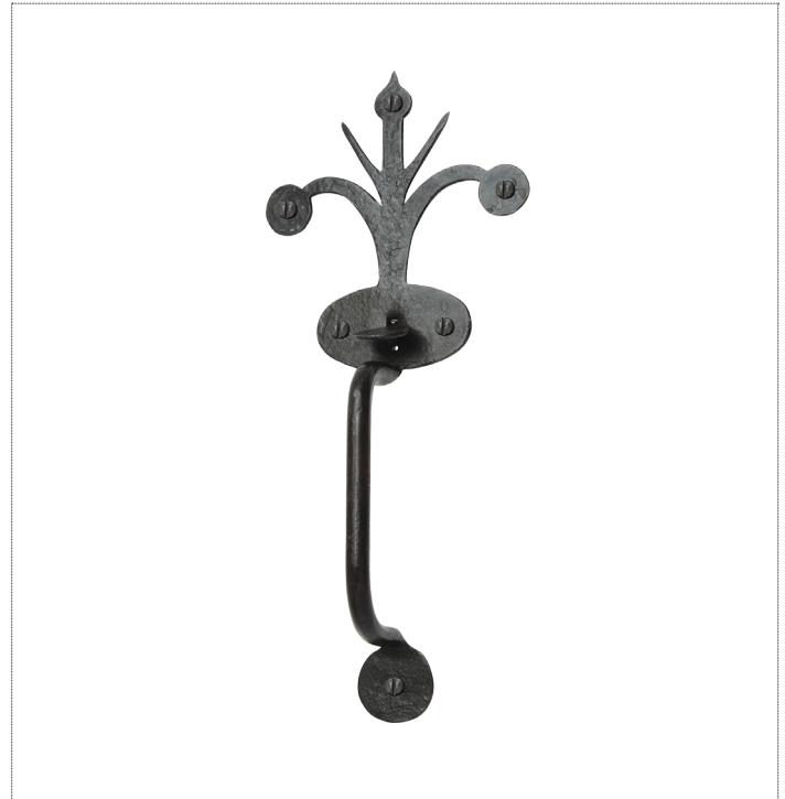
Shown with a dark wax iron finish.