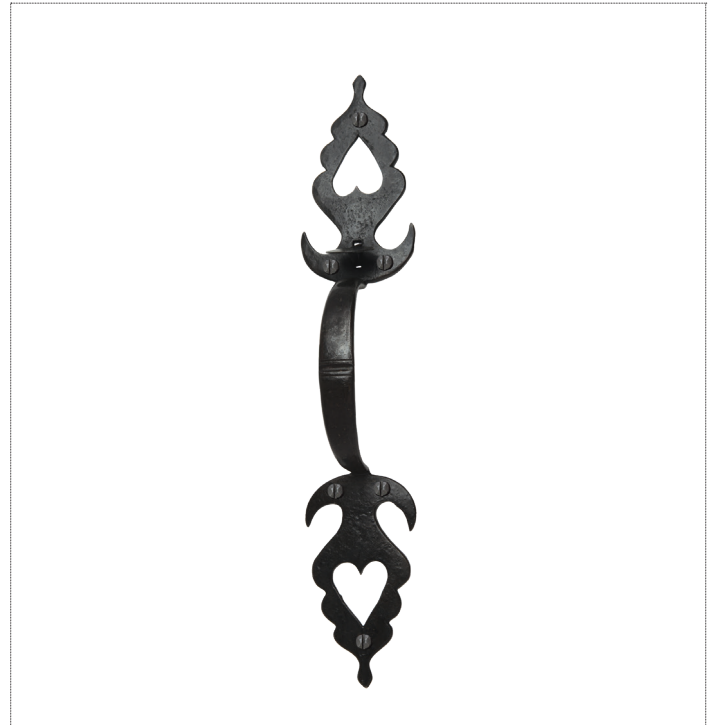
Shown with a dark wax iron finish.