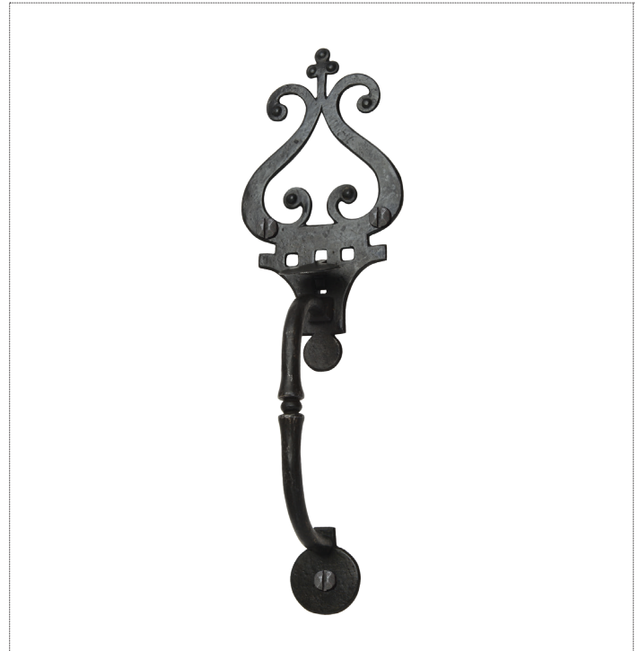
Shown with a dark wax iron finish.

Forged iron crown top thumb latch with lift bar and keeper.