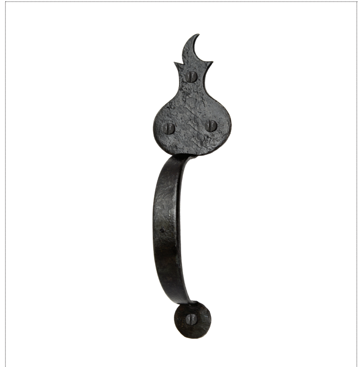
Shown with a dark wax iron finish.

Forged iron flame top pull with lift bar and keeper.