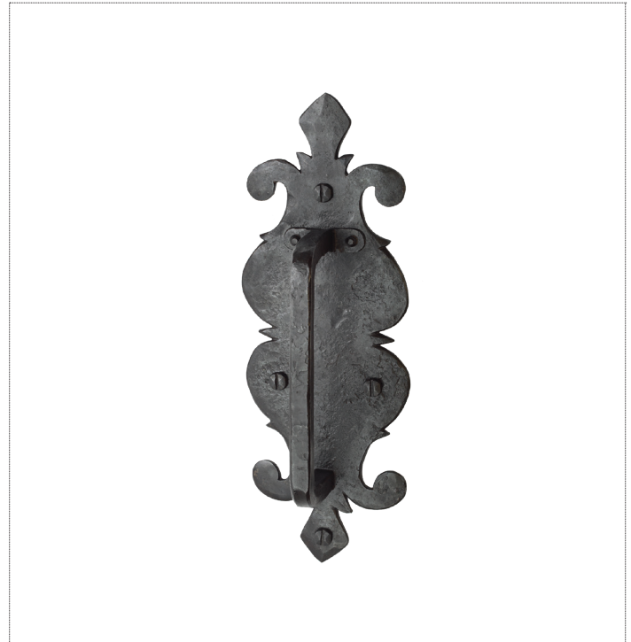
Shown with a dark wax iron finish.