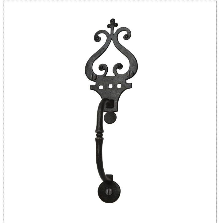
Shown with a dark wax iron finish.

Forged iron crown top pull with lift bar and keeper.