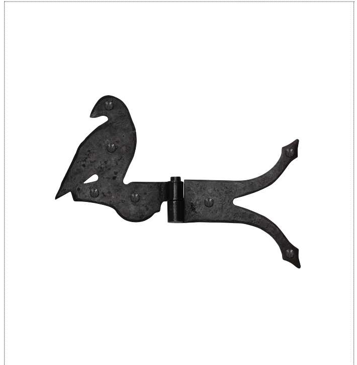
Shown as right hand with a dark wax iron finish.