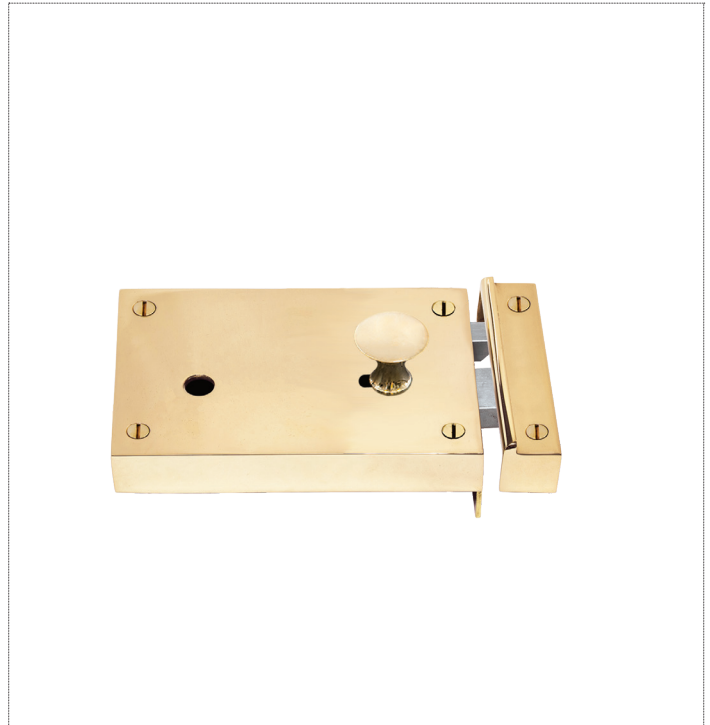
Shown as right hand with a polished brass finish.

Small cast brass horizontal rim lock with sliding deadbolt