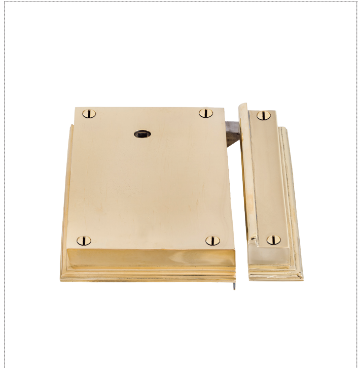
Shown as right hand with a polished brass finish.

Molded cast brass vertical passage rim lock.