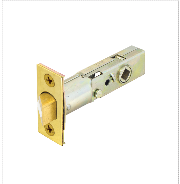
Shown with a polished brass finish.

Passage tubular mortise door latch for knobs and levers.