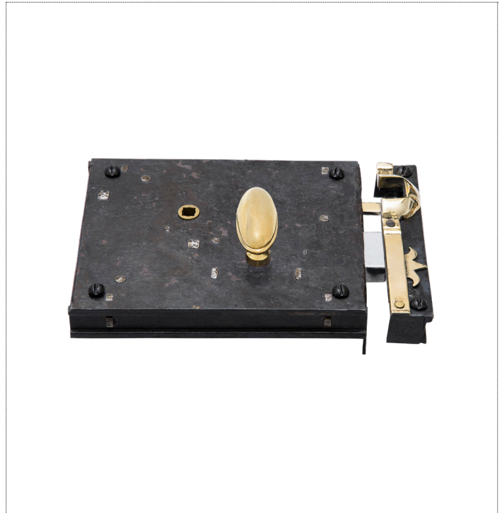
Shown as right hand with a dark wax iron finish.

Small forged iron horizontal carpenter lock with thumb turn and keeper.