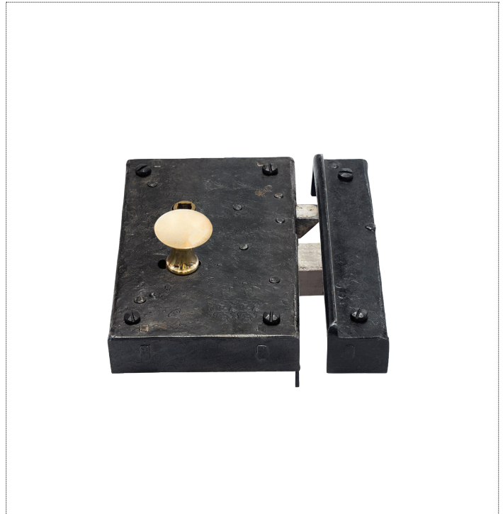
Shown as right hand with a dark wax iron finish.

Small forged iron vertical rim lock with sliding deadbolt and keeper.